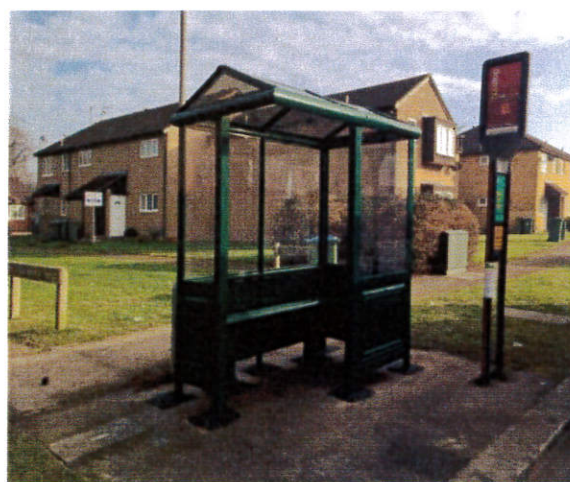
The shelter to the left is a 3 Bus Shelter with 1 full end panel and 1 quarter end panel and perch seating.