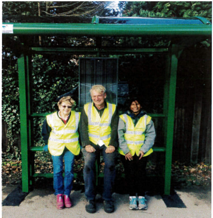
Sunningdale Parish Councillors enjoying their new shelter

"Everything was done to an extremely high standard; the fitting team were both very friendly and efficient. A job very well done!" – Sunningdale Parish Council