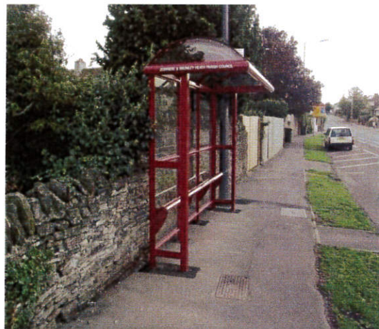
Above are two 3 bay cantilever shelter with half glazed end panels & perch seating.